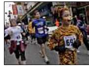
Eye of the tiger in Chinatown (pics)

Home News Sports Business Entertainment Food Living Travel Columns Buy & Sell Jobs Real Estate Cars Site Index [return to top]