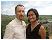
Where do we learn lessons on money?