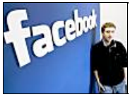
Facebook's dirty little energy secret