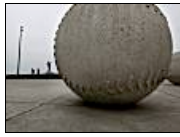
Outtakes: Chron photogs have a ball